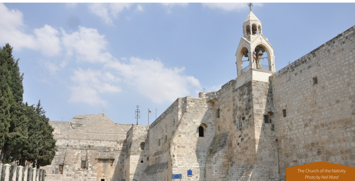
The Church of the Nativity

The Church of the Nativity in Bethlehem, built at the precise site of Jesus’ birth, is usually abounding with thousands of tourists at Christmas, decked in Christmas finery and full of festivities. On Christmas Eve, the archbishop and entourage processes through the streets to the church, led by the Boy Scouts bagpipe band and thronged with rejoicing faithful, both Palestinian Christian locals (who are the majority of Bethlehem’s population) and pilgrims from around the world.